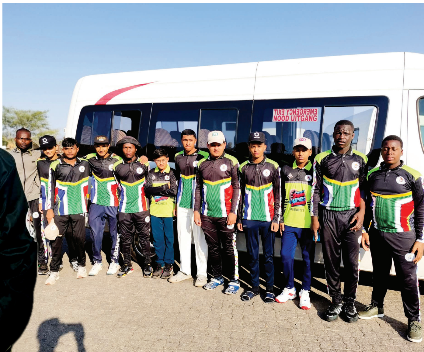
Tubatse Cricket Club emerged victorious during the league matches topping the Sekhukhune Federation Under-21 League.

DENNILTON - The Sekhukhune Federation Under-21 League group matches were played in Dennilton on Sunday 5 October 2025.