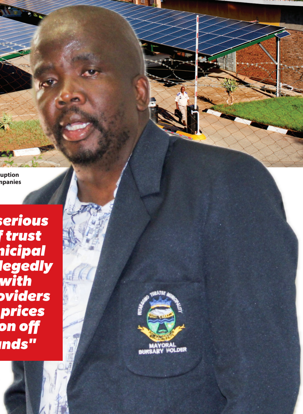
FTLM Political Head, Mayor Cllr Eddie Maila, whose municipality is embroiled in alleged corruption and maladministration scandals

"It is a serious breach of trust when municipal officials allegedly collude with service providers to inflate prices and siphon off public funds"