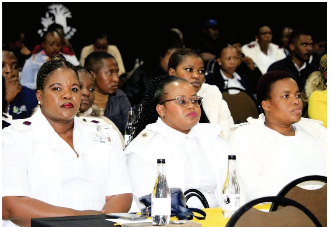
The newly appointed health professionals were officially unveiled at Bolivia Lodge in Polokwane.