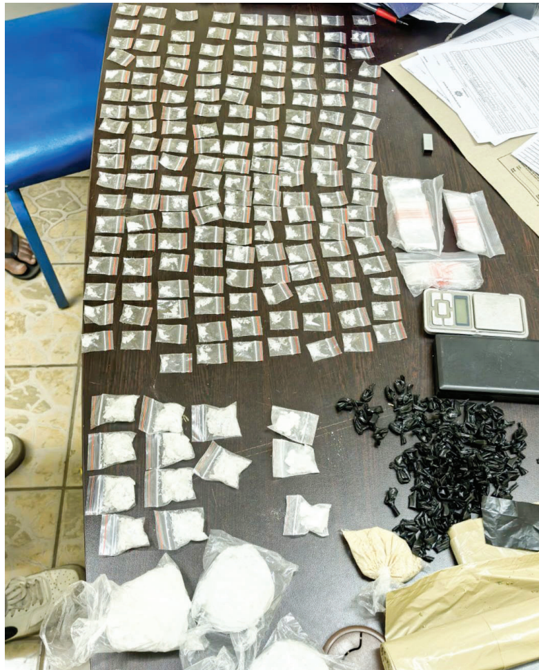
Various drugs were recovered by the police during the ongoing provincial Operation Shanela.