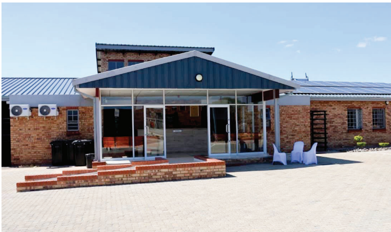
The newly constructed state-of-the-art Bakwena Ba Matsepe Traditional Council offices