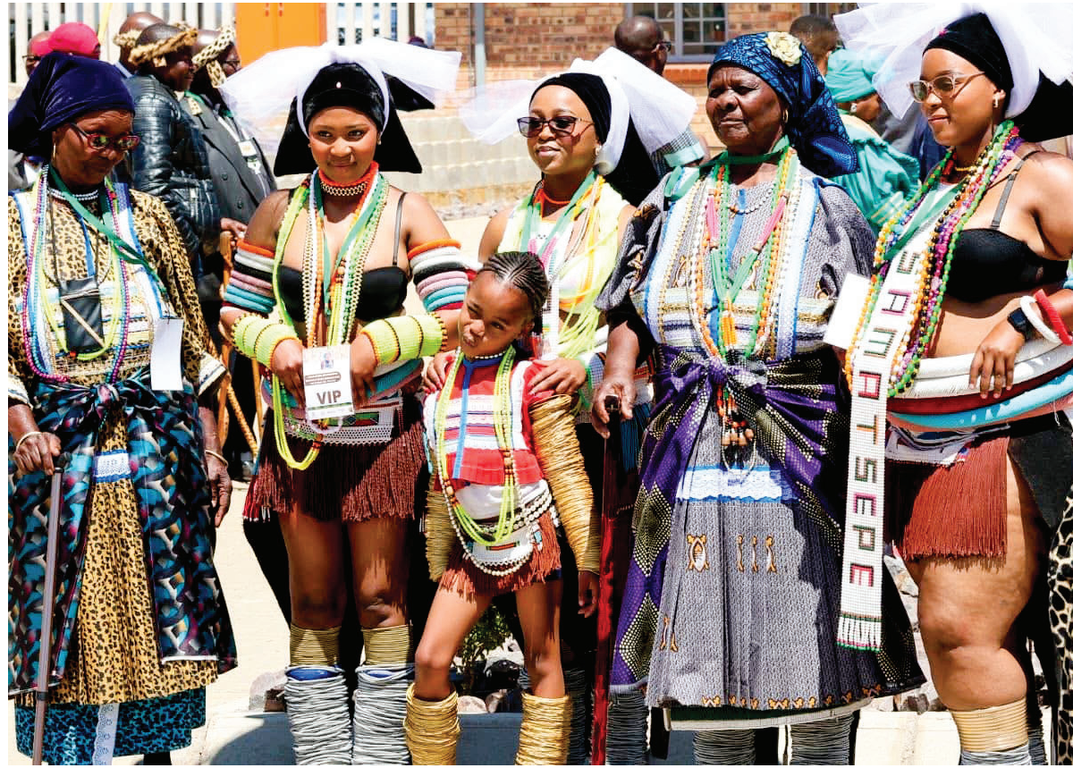
Tafelkop residents dressed in their traditional attire converged to witness the historic handing-over of the newly constructed state-of-the-art Bakwena Ba Matsepe Traditional Council offices.