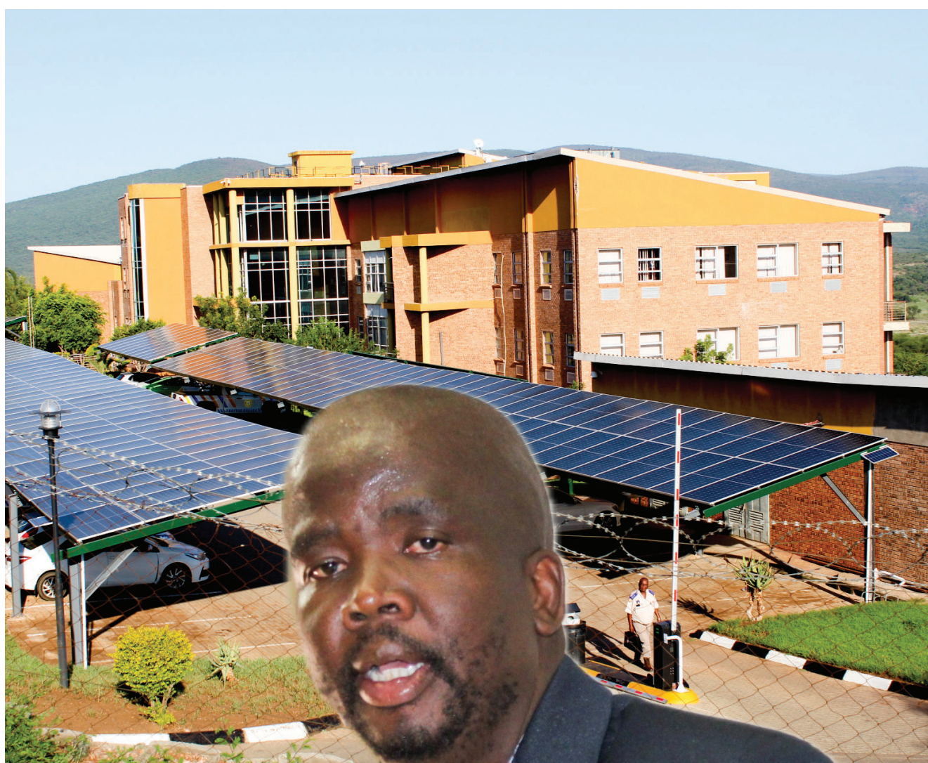
The FTLM is embroiled in a corruption scandal involving favourite companies and senior officials.

When asked for a comment, the municipality could not respond to the enquiries sent by the publication.