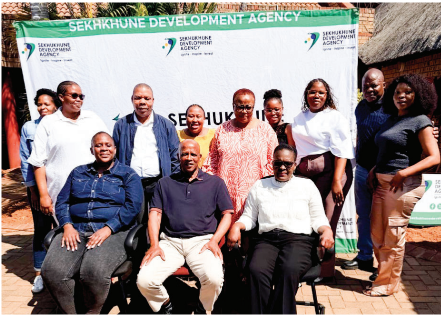
SDM senior officials and stakeholders including the SDA during a special meeting held at the SDM Offices in West Street, Groblersdal.