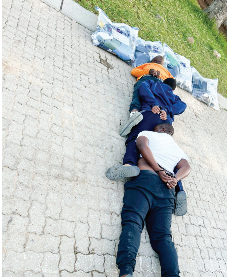
Some of the suspects who were arrested by the police during the high-density Operation Shanela.