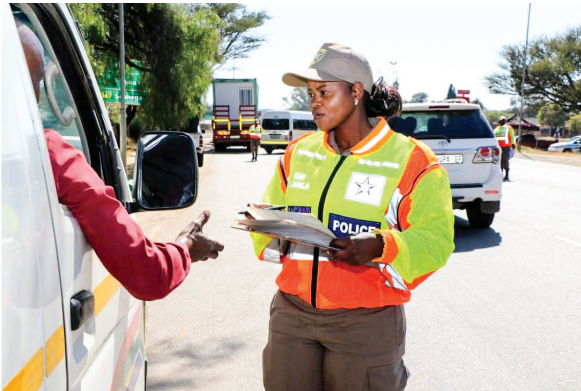
Traffic law enforcement officers in Limpopo preparing for an intensive operation targeting drunken drivers across the province.