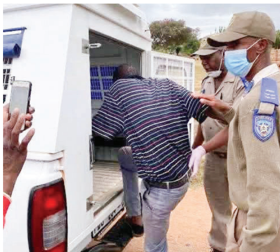
The Traffic enforcement in Limpopo arrested a suspect for driving under the influence of alcohol during an intensive weekend operation.