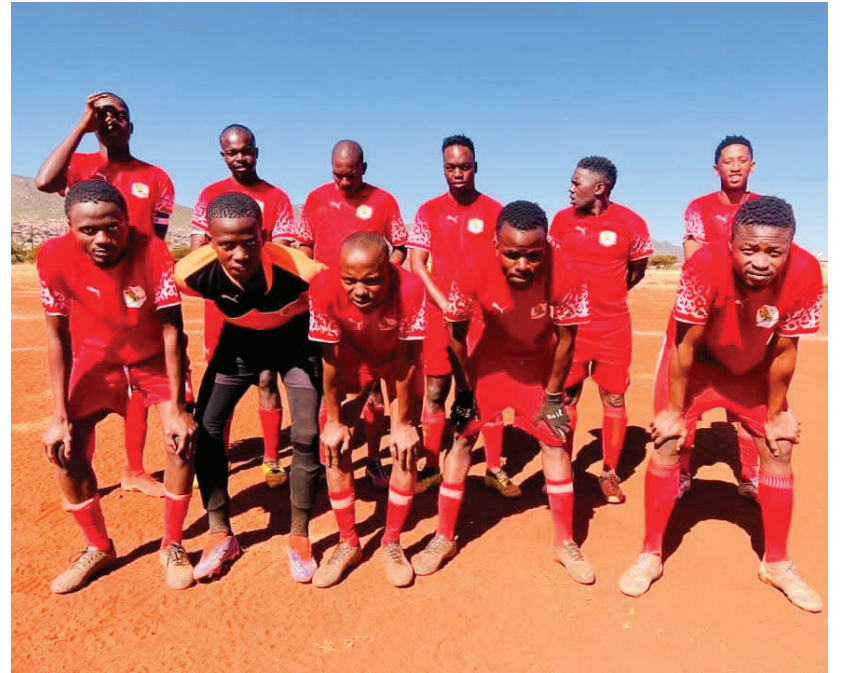
Tsa Boshago FC from Ga-Phaahla Village is among teams determined to win the SAFA Sekhukhune Regional Football League.