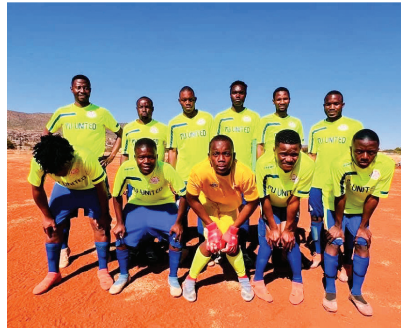
MJ United FC will form part of the upcoming football season in the SAFA Sekhukhune Regional Football League.