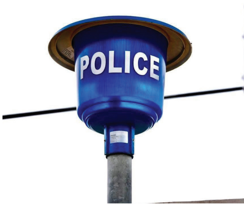
The police in Dennilton have launched a massive manhunt for unknown suspects following two separate business robbery incidents occurred on Friday 3 October 2025

He said the operation was conducted through various activities including stop and search where a total of 4,695 vehicles were stopped and searched, compliance inspections with 722 licensed liquor premises inspected, informal business inspections with 2,736 informal businesses, including spaza shops, were inspected. The Provincial Commissioner of the Police in Limpopo, Lieutenant General Thembi Hadebe, praised the law enforcement agencies and stakeholders for their collaboration in combating crime. "The outcomes of Operation Shanela demonstrate the commitment of the South African Police Service to ensuring the safety and security of all citizens," said Lieutenant General Hadebe.