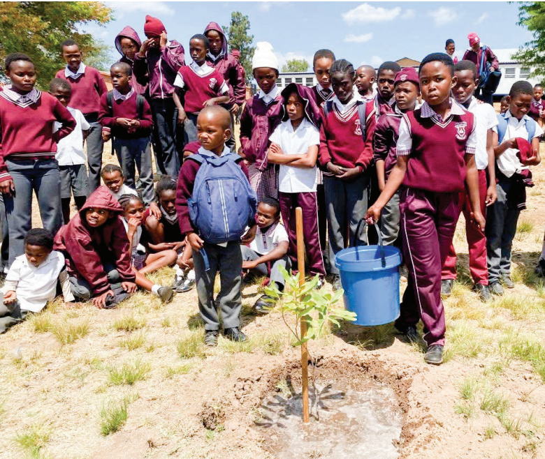
EMLM donated 40 trees to local schools as part of the national 1 Million Tree Planting Programme aiming to fight global warming.